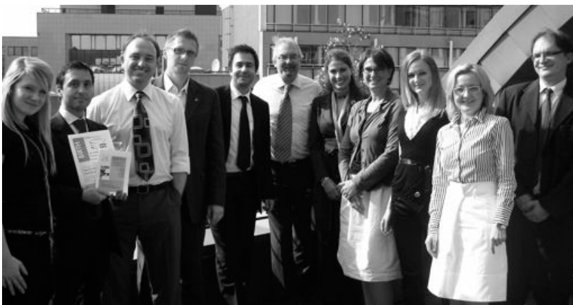
BIRTH team, organisational meeting 9th September 2008, West Midlands in Europe

One of the guiding principles of the European Commission states that a "high level of human health protection shall be ensured in the definition and implementation of all Community policies and activities". This workshop will discuss the positive impact that investment in health can have on the economic growth of territories and review how Structural Funds can be used to foster investment in health promotion. Best practices for investment in health promotion will be presented by representatives of European Regions.